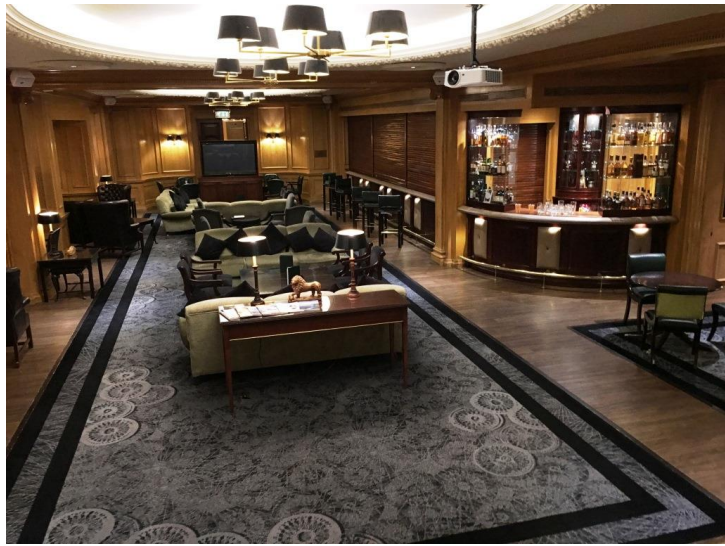
The Long Bar in the basement