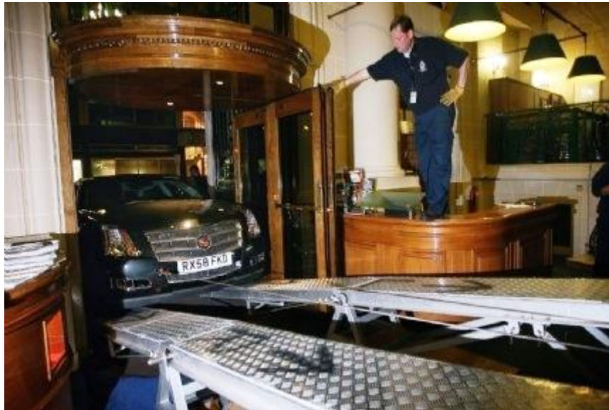
Getting cars into the Rotunda is not easy