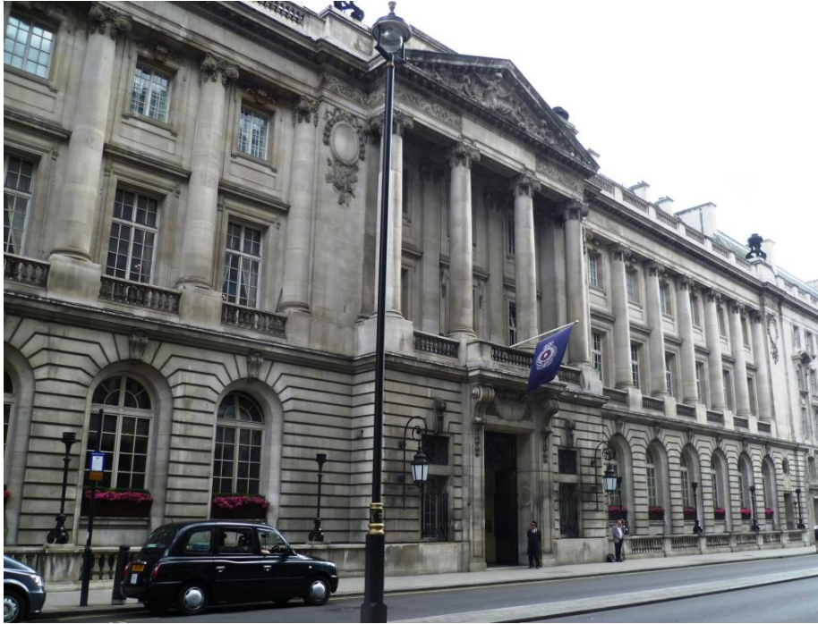
The RAC building is so large that it is virtually impossible to get it all into one shot. Here about one quarter, on the left, is missing.