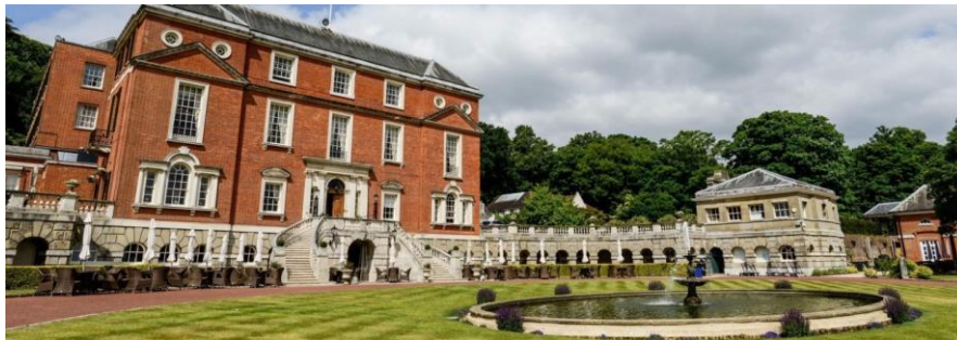
Above and below: The huge RAC country facility at Woodcote Park, Surrey, open to reciprocals