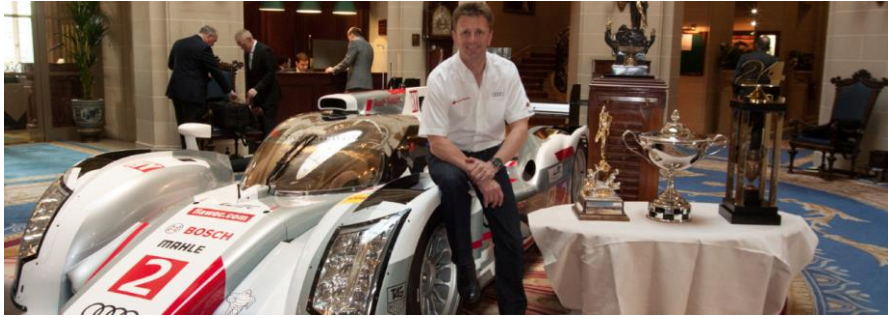
Photos above: various cars from the RAC fleet or members, on show in the central Rotunda room